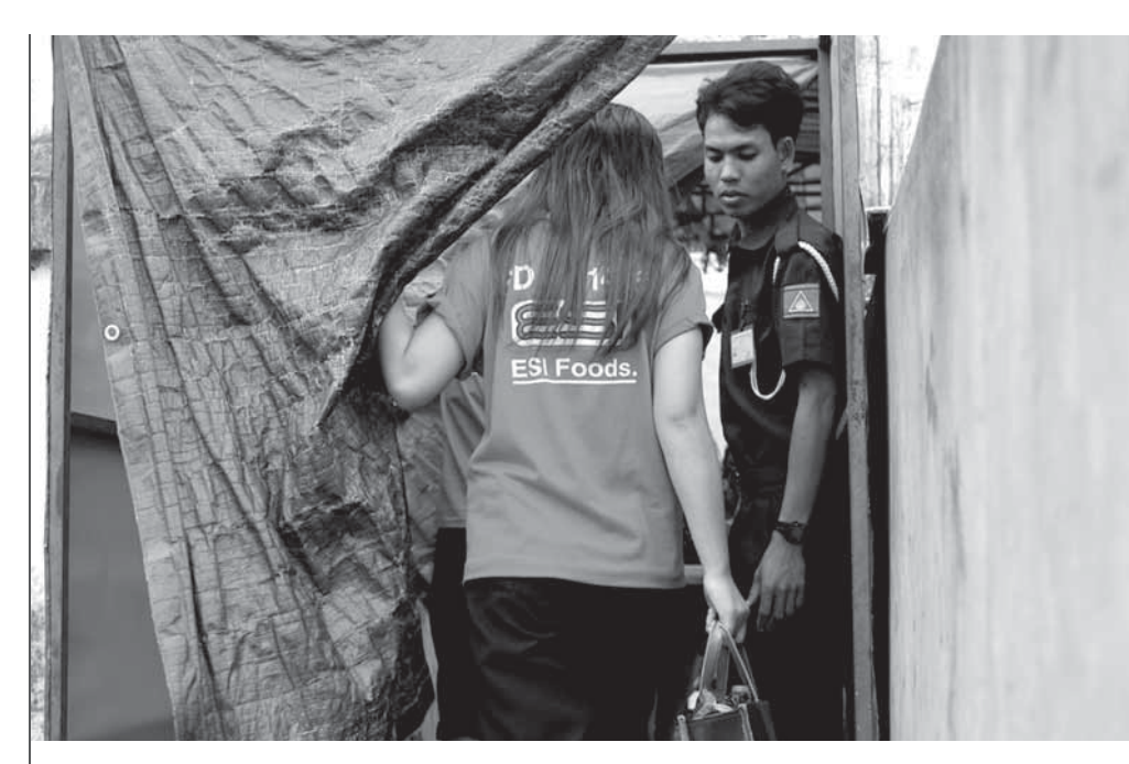
Burmese worker arrives for the late shift at a coffee factory in Hlaing Thar Yar Industrial Zone. Yangon, Myanmar, June 2016

Many Myanmar migrants face substantial barriers to obtaining national identification due to outdated policies and are therefore excluded from full citizenship rights. National Registration Cards, also known as Citizenship Scrutiny Cards, are issued by the Ministry of Immigration and Population's Immigration and