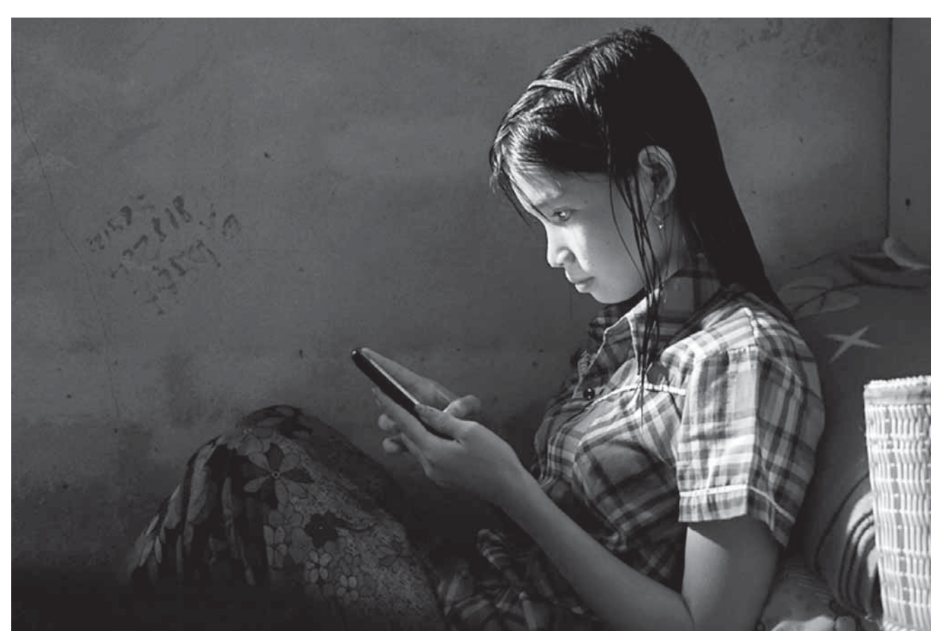
Burmese garment worker relaxes on her day off. Yangon, Myanmar, June 2016