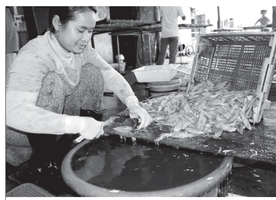
Cambodian migrant woman sorting squids. Rayong, Thailand, March 2016

Six months after registering for Social Security, women are entitled to maternity leave benefits and child support, but it is rare for migrant women to receive these benefits. They must be well informed and assertive to claim their rights. Many migrant women may quit their jobs due to pressure from their employers, which is illegal, or choose to leave of their own accord, thinking that they do not want to be a burden and lacking understanding that they are forfeiting their rights.<sup>41</sup> When they return to work,