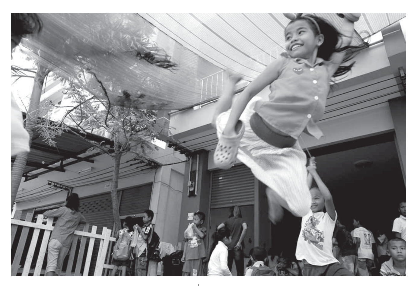
Children playing before classes begin at a migrant school. Rayong, Thailand, March 2016