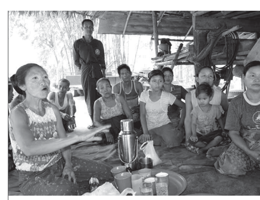
Burmese migrants discuss their migration experiences with MMN delegation. Mae Sot, Thailand, March 2016

Over time, as a way of breaking down barriers and focusing on the positives of being different, CSOs have encouraged cultural exchange activities with dance and food provided by both migrant and local Thai communities. Cultural activities like this are an easy way to break down barriers as it gives a platform to understand each other's differences through activities which are familiar, such as cultural expression and eating. Often this goes on during holidays, such as Thai Mother's Day or on religious holidays. In some communities migrants partake in merit making ceremonies alongside Thais. However, once the festivities are over, the two groups generally go their separate ways. In some of the interviews conducted during site visits by the MMN team, it was revealed that very few migrants have Thai friends. So, when there is interaction between the two communities, it is commonly fleeting and not very deep. In a study by the ILO, it was found that four out of 10 Thai respondents have had no direct encounters with migrants at all.65