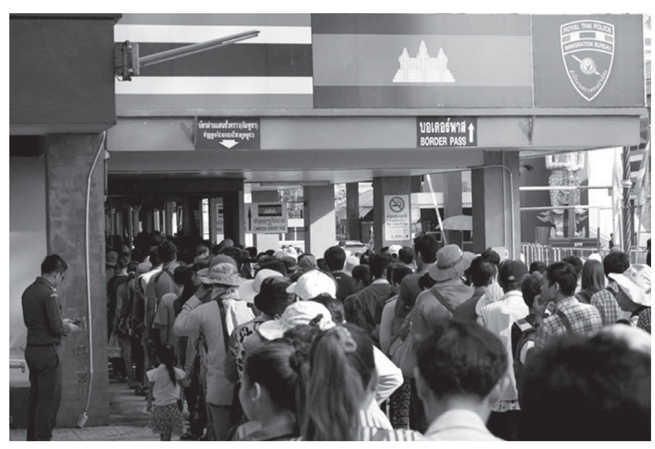
A number of migrants cross the Cambodia-Thailand border every day. Poi Pet, Cambodia, May 2016