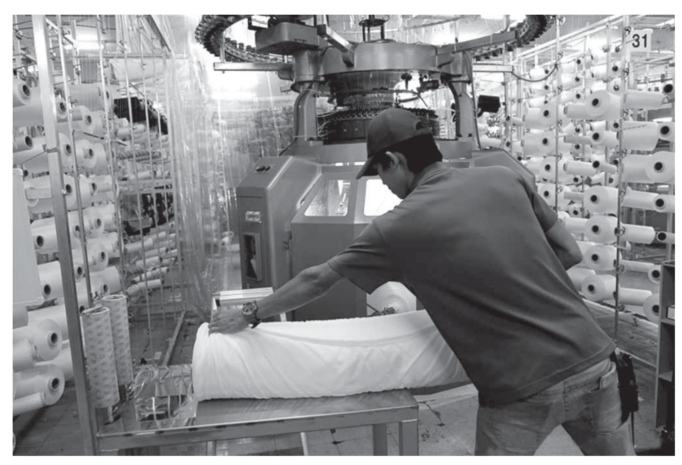
Burmese migrant trainee working in a garment factory. Komatsu, Japan, July 2016