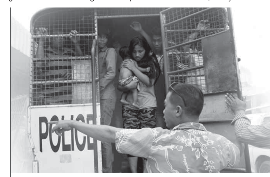
Undocumented migrants in destination countries live a precarious existence and are at constant risk of arrest and deportation. Poi Pet, Cambodia, May 2016

cross-border migrant workers fear that returning home to register and vote will result in the loss of their job or arrest, particularly if they migrated through irregular channels. Regardless, the National Election Committee maintains that an absentee voting system would increase the risk of voter fraud, and that it would be costly to register international voters. The government also claims that the Kingdom's proportional representative electoral system is incompatible with absentee voting and questions which province overseas Cambodians would register in and how they would manage voting in multiple time zones. The solution of the province overseas Cambodians would register in and how they