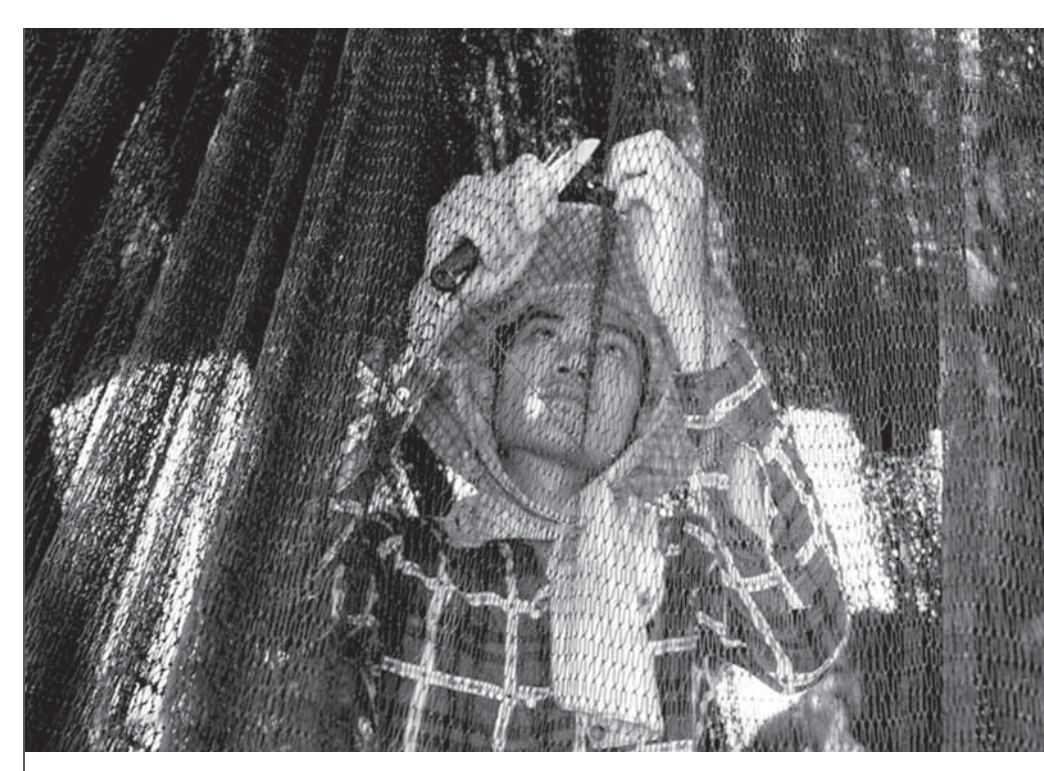
Cambodian migrant fisherman repairing a net. Rayong, Thailand, March 2016

The Royal Government of Cambodia's Labour Migration Policy for Cambodia 2015-2018 is a key document that outlines actions promoting the social inclusion of migrants. Building on the previous Policy on Labour Migration for Cambodia 2010-2015, this policy aligns with the goals and timelines of other national policies. In particular, the policy introduces "measures to ensure that new job seekers can be productively employed and develop their skills to be able to work in emerging, rather than vulnerable sectors in both Cambodia and destination countries". The policy links to the Cambodia National Employment Policy, which supports the mobility of workers and employment generation. It also aligns with the National Strategic Development Plan 2014-2018, which frames emigration as a population issue that is integrated into national development planning processes. Hemployment generation is key to ensuring that migrants are included in the national economy upon return. Job creation is also necessary to provide potential migrants with livelihood options at home and thus a real choice about whether or not to migrate opposed to feeling as though migration is the only pathway to a secure livelihood. While the Labour Migration Policy is comprehensive and promotes strategies to generate employment and foster the social inclusion of migrant workers through all stages of the migration process, its implementation and effectiveness in promoting inclusion will need to be evaluated in the future.