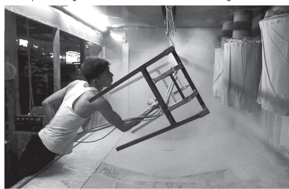
Burmese man working in a metal furniture factory in South Dagon Industrial Zone. Yangon, Myanmar, June 2016

There is also a lack of recognition of and value ascribed to the experiences and skills attained by workers abroad. MMN member organisations learned from migrant returnees that it is extremely difficult to secure a higherskilled job in Myanmar without possessing a certificate recognising previous work experiences and skills. Employers in destination countries generally do not provide this, nor do many workers feel they can ask for it, or indeed know that they should ask for it. Moreover, some migrants return home with aspirations of starting their own business but lack access to the financing needed to do so. While there is a growing diversity in the supply of microfinance in Myanmar today, many people in more remote areas are still only able to access informal, unregulated channels of credit, often at exceptionally high interest rates.<sup>107</sup>